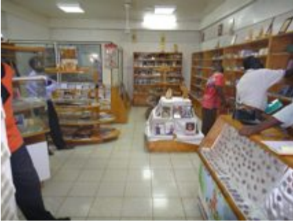
Scripture Union Bookshop Kisumu, Kenya

So how do we solve the problem of literature distribution? Scripture Union has a good network of bookshops throughout East Africa - but they tend to be in the major cities and not everyone goes to the big cities. Kanisa la Biblia Bookshop (Church of the Bible) in Dodoma and Soma Biblia (Read the Bible) in Dar es Salaam both stock and sell APF literature. Soma Biblia are distributing throughout Tanzania and selling from mobile vans that travel further afield.