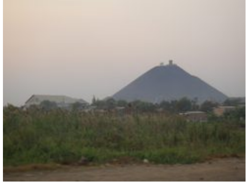
Mining area in Lubumbashi

So the pastors face real problems. In the area served by Bukavu many of the militant groups still operate. DR Congo has the highest rate of sexual violence against women in the world. Rape is commonplace and often used by the terrorist militia groups to subdue the local population.