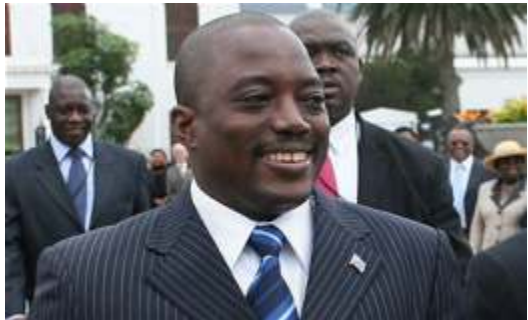
President of D.R.Congo Joseph Kabila

The election results were delayed several days partly due to the ballot boxes from outlying areas taking so long to come in, some due to delays in the voting taking place. The initial result is that the standing President Joseph Kabila won 49% of the vote against the opposition's 32% for Etienne Tshisekedi. But Mr Tshisekedi has rejected the results and declared himself president, raising fears of violent protests. There are issues which the Election Observers are looking at, but these are not expected to change the over-all result.